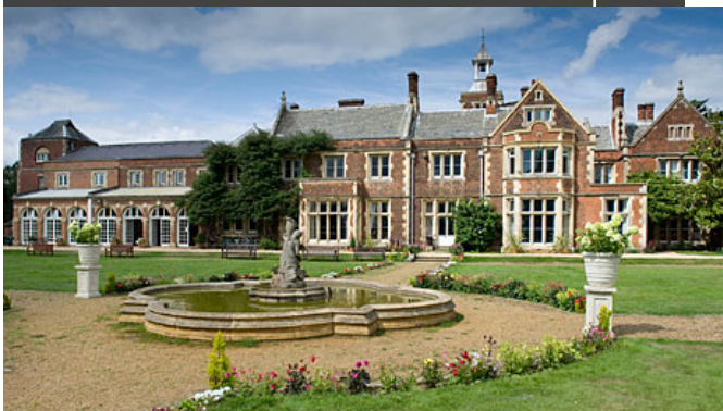
High Leigh Conference Centre

http://www.cct.org.uk/smartweb/high-leigh/introduction